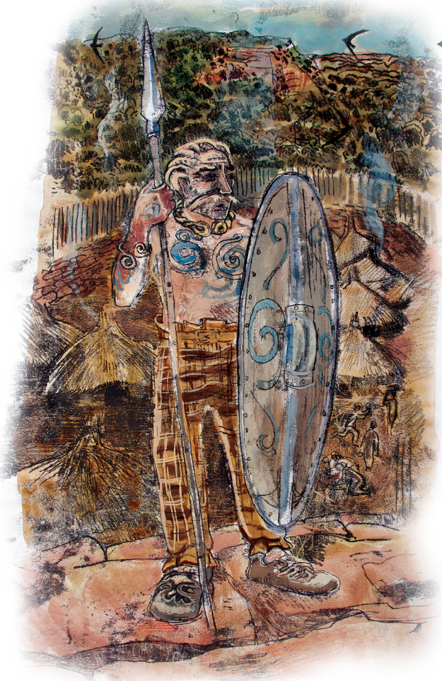
Fierce Warriors Iron Age warriors were part of an elite class obsessed with bragging, brawling and drinking

Maiden Castle is the southernmost of the hillforts on the Cheshire Sandstone Ridge, with commanding views to the south, east and west. It occupies an outcrop that rises gently from the southeast with steep sandstone bluffs to the west. The hillfort makes the most of these cliffs, enclosing three acres of the hill within twin, curved ramparts and an intervening ditch. Excavations in 1934-5 uncovered an inturned entrance with possible guard chambers at the northern end of the defences. Further evidence suggests there may have been three building phases at Maiden Castle: an early freestanding timber palisade, possibly from around 900 BC; a timber-laced and stone-faced inner rampart from around 470 BC; and a stone-faced outer rampart from around 400 BC.