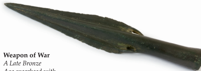
Weapon of War A Late Bronze Age spearhead with leaf-shaped blade and basal loops, dating from around 1500- 1200 BC, from the Broxton Hoard

The mounds and hollows within the hillfort seem to be the result of quarrying in recent centuries, but could conceal earlier features. It's possible, too, that the nearby cave at Mad Allen's Hole may have been occupied in prehistoric times. But surely the most interesting theory is that the hillfort could have been associated with the possible, but as yet unproven, prehistoric mining of a vein of copper that runs along the eastern side of the Bickerton hills.